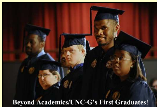
Beyond Academics/UNC-G's First Graduates!